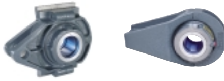
Take Up Tension Type 1 3/16"/30mm to 6"/155mm Available in cast iron Also offered as push type Rod End Shoe Type 1 3/16"/30mm to 6"/155mm Available in cast iron Also offered as tee type