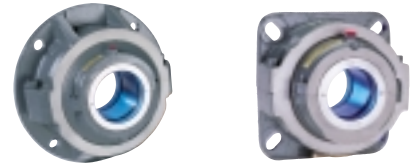
Round Flange Units 1 3/16"/30mm to 12"/300mm Available in cast iron or steel Square Flange Units 1 1/16"/50mm to 3"/75mm Available in cast iron, ductile iron or steel