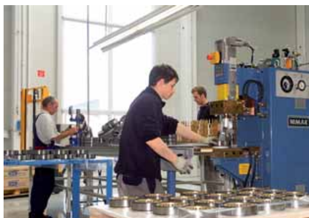
NKE's new modular component assembly enables prompt production of your ordered items.